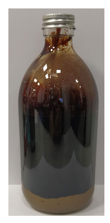
Figure 2: Two -phase product from bio-oil hydrotreatment of RUN-03

Significant improvement has been achieved over the starting bio-oil properties. The density of the initial bio-oil was reduced from 1.045 to ~0.95 g/ml showing that cracking reactions of the heavy molecules were successful. Furthermore, the sulfur content was reduced from 3270 wppm (bio-oil + DMDS) to 52-110 wppm due to the successfulness of hydrodesulfurization reactions. The oxygen content, as well as the dissolved water of the initial bio-oil, were removed via hydrodeoxygenation reactions leading, to an organic phase product with significantly reduced oxygen (<5.6 wt%) and dissolved water (<1 wt%) content. Finally, significant improvements were also achieved in viscosity which was reduced to <25 cSt and total acid number – TAN – which reached negligible levels. In general, it was validated in TRL5 that the AFP bio-oil hydrotreatment renders a high-quality organic phase liquid product with low density, high carbon and hydrogen content, negligible oxygen as well as water content and improved viscosity and TAN, properties that allow its potential use as a refinery co-feed.